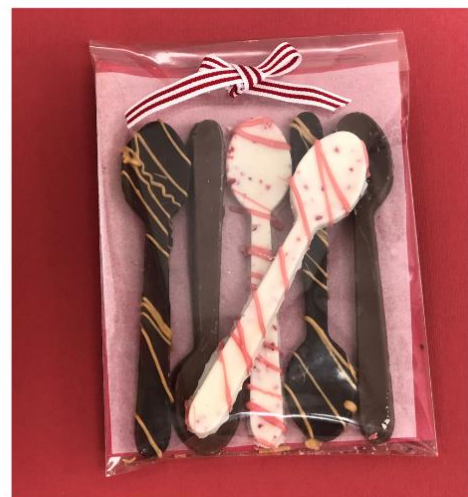
HOT CHOCOLATE SPOONS

Set of 6, mix with warm milk for a hot chocolate treat