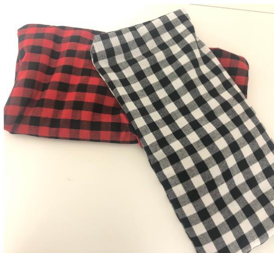
BUFFALO PRINT RICE HEAT PACK

Choice of red and black or white and black