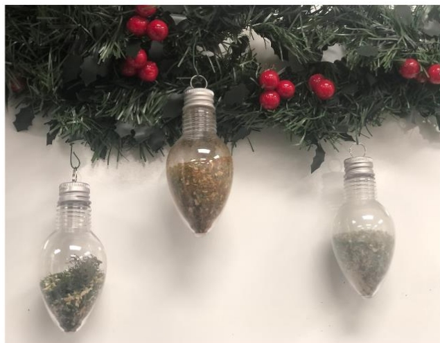
$10 THREE PACK OF ORNAMENT DIPS