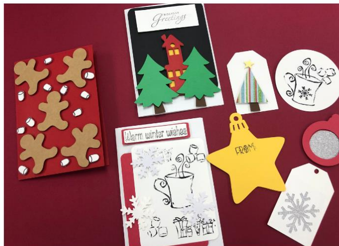
HANDCRAFTED HOLIDAY CARDS & GIFT TAGS