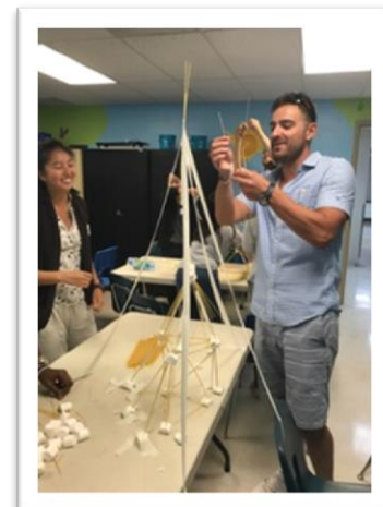
Also scheduled some team building activities!